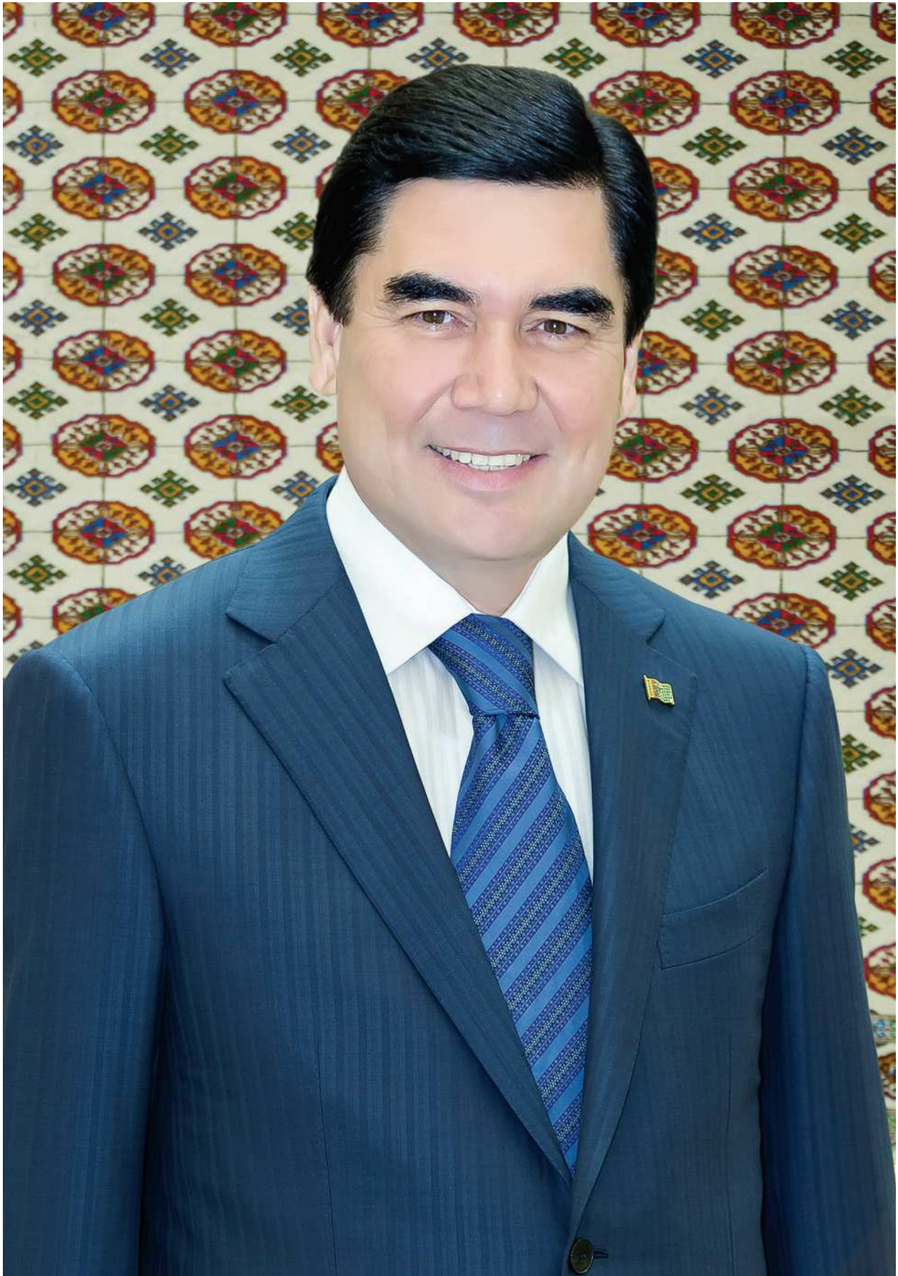
TURKMENISTANYN PREZIDENTI GURBANGULY BERDIMUHAMEDOW