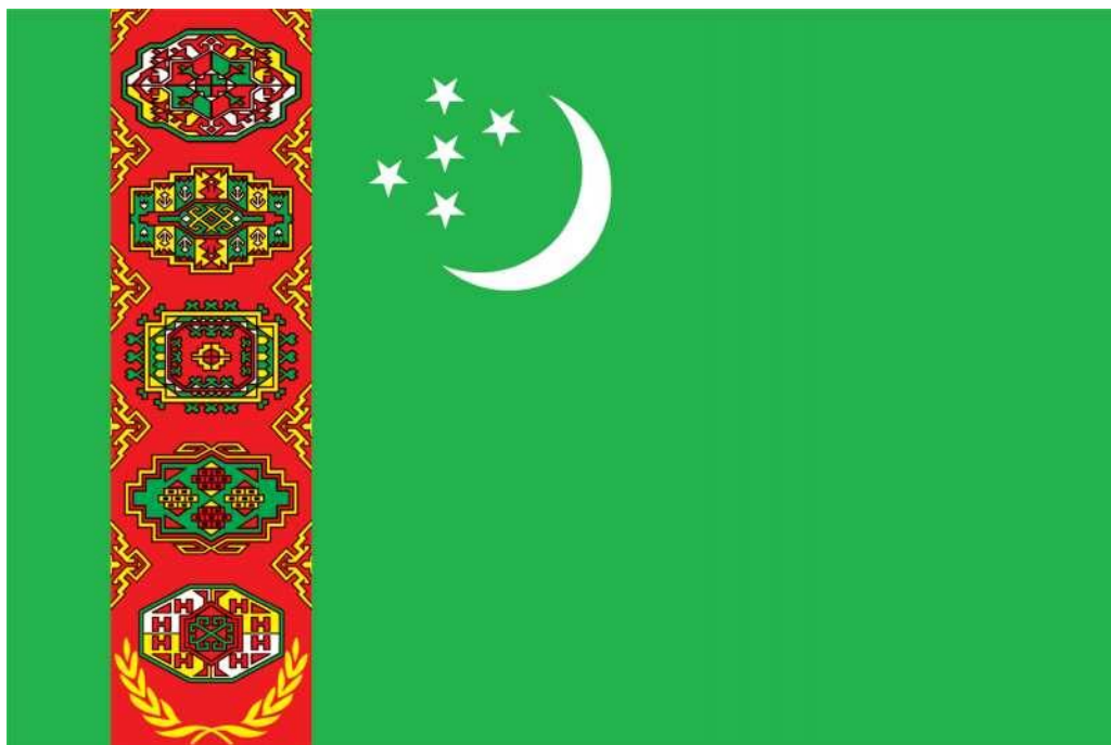
TURKMENISTANYN DOWLET BAYDAGY