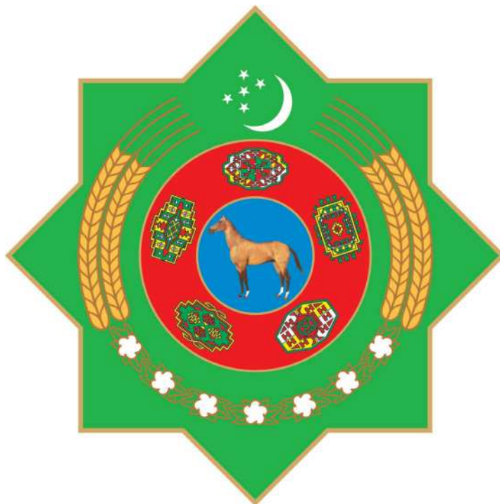
TURKMENISTANYN DOWLET TUGRASY