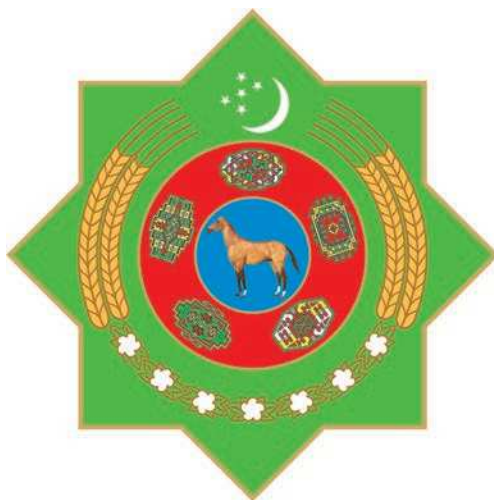
TÜRKMENISTANYŇ DÖWLET TUGRASY