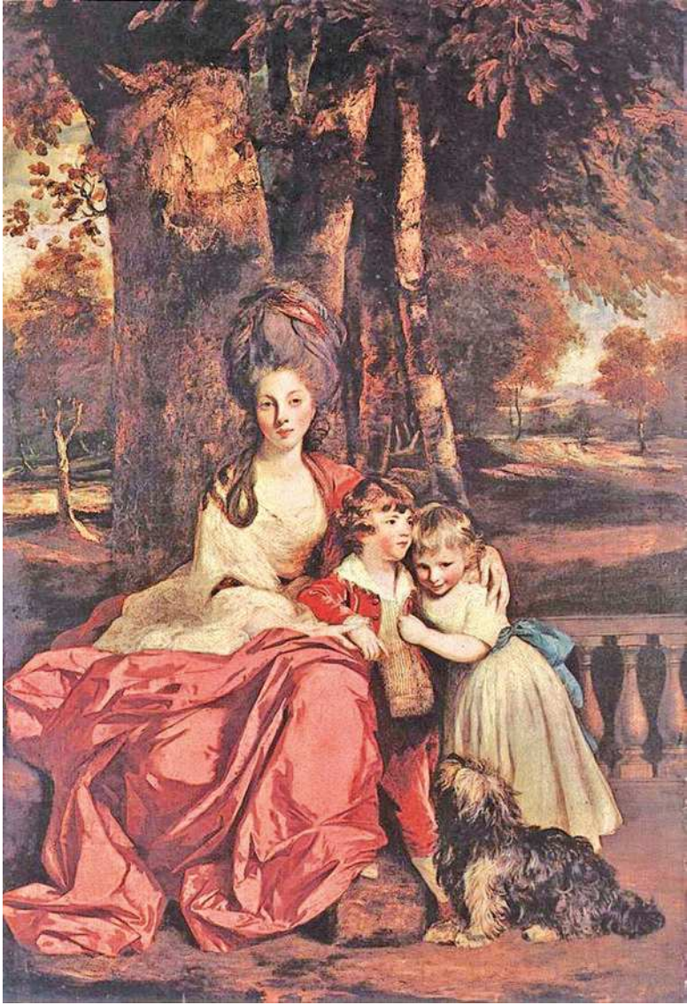
Sir Joshua Reynolds. Lady Elizabeth Delme and Her Children. 1777–1780