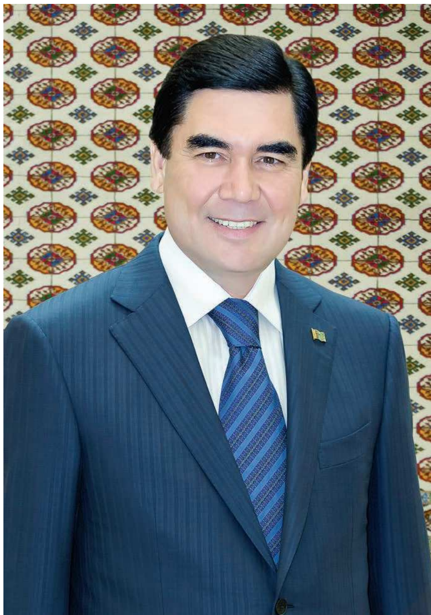
TÜRKMENISTANYŇ PREZIDENTI GURBANGULY BERDIMUHAMEDOW