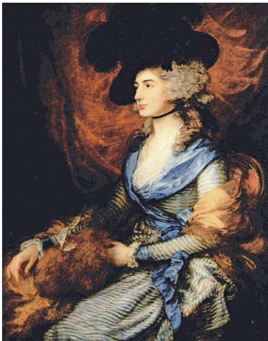
Thomas Gainsborough Mrs Sarah Siddons. 1783-1785