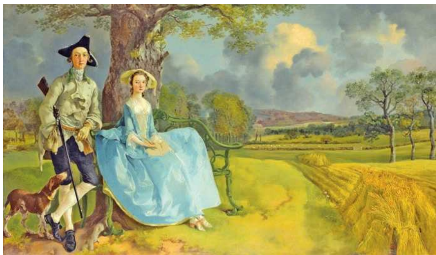
Thomas Gainsborough. Robert Andrews and Mary, His Wife. 1750