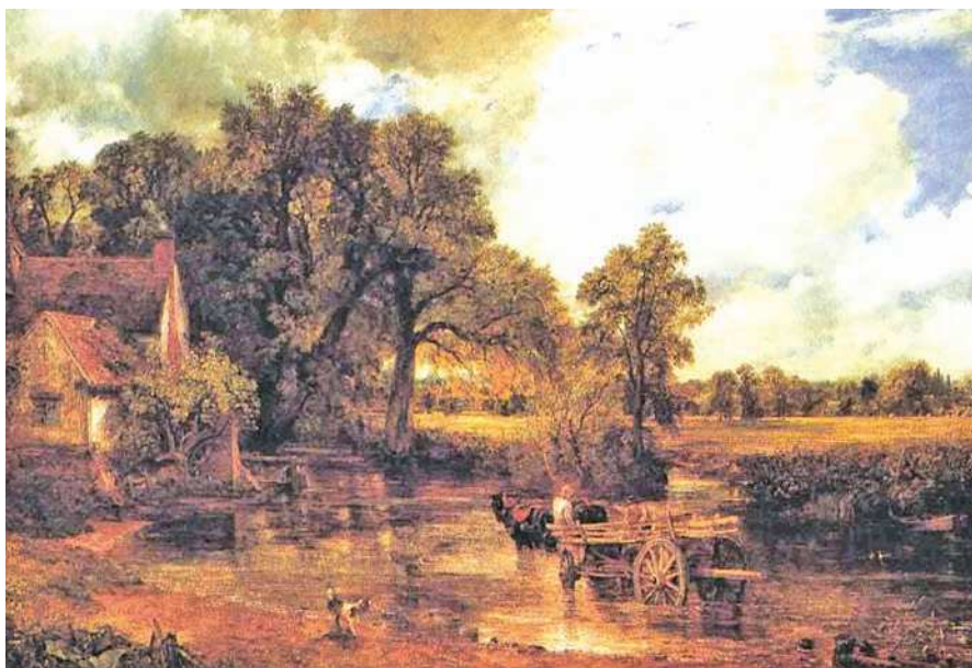
John Constable. The Haywain. 1821