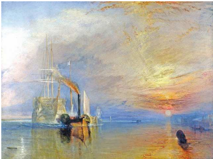
J. M. W. Turner. The "Fighting Temeraire" Tugged to Her Last Berth To Be Broken Up. 1839