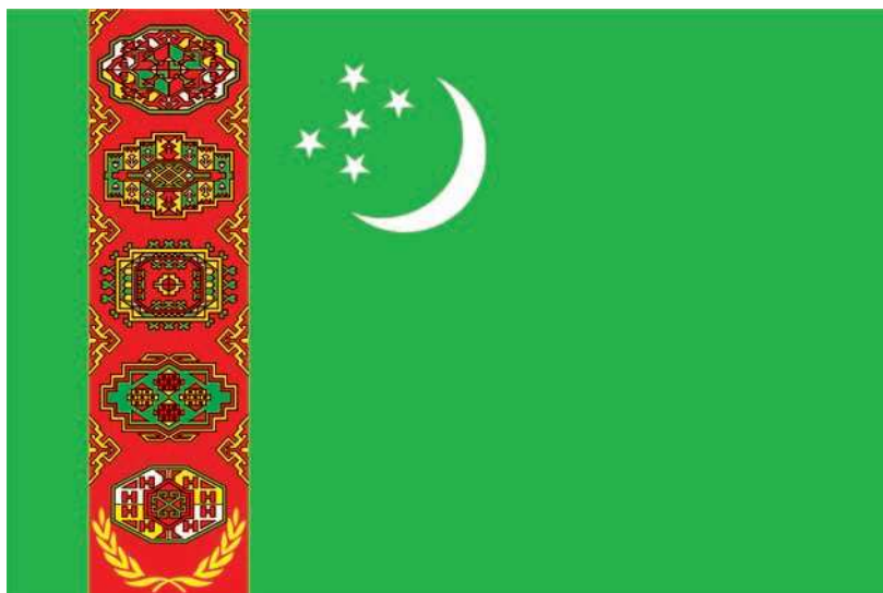
TÜRKMENISTANYŇ DÖWLET BAÝDAGY