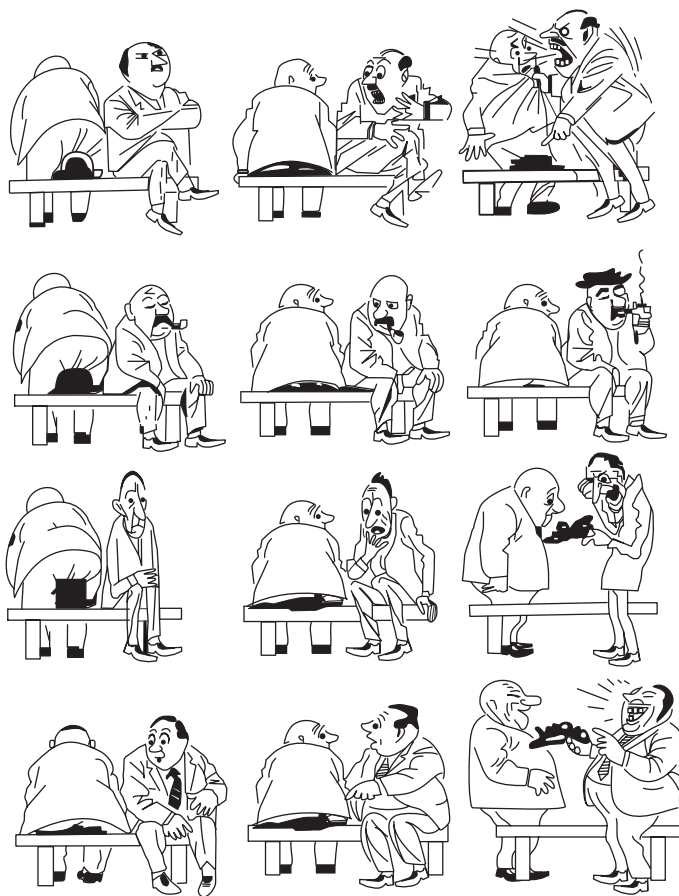
The Four Temperaments