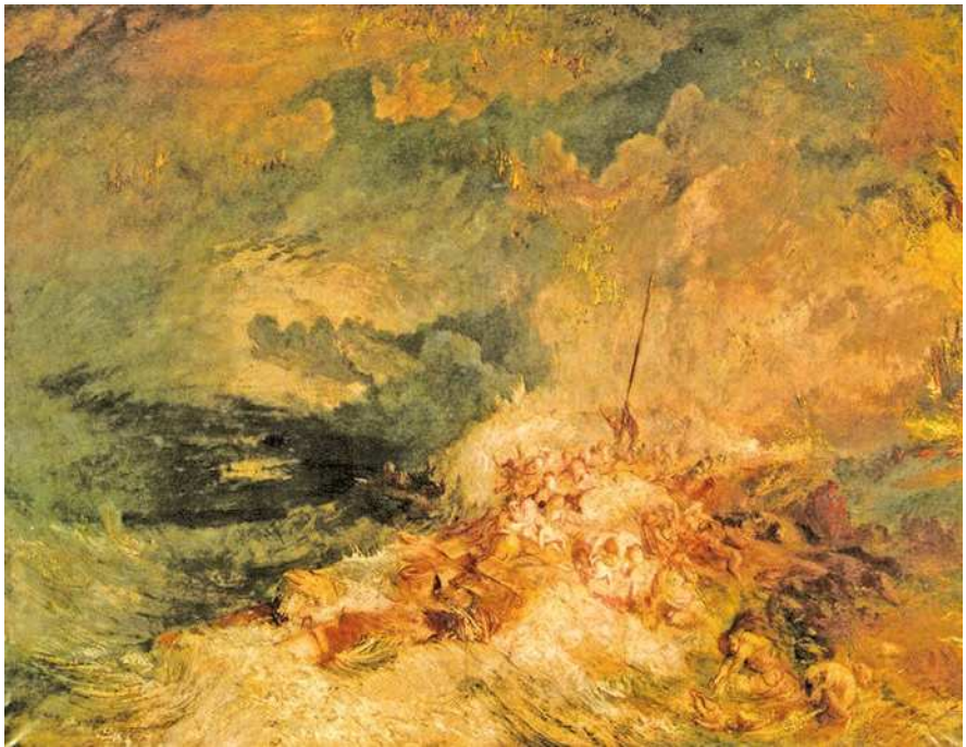
J. M. W. Turner. Fire at Sea. 1834