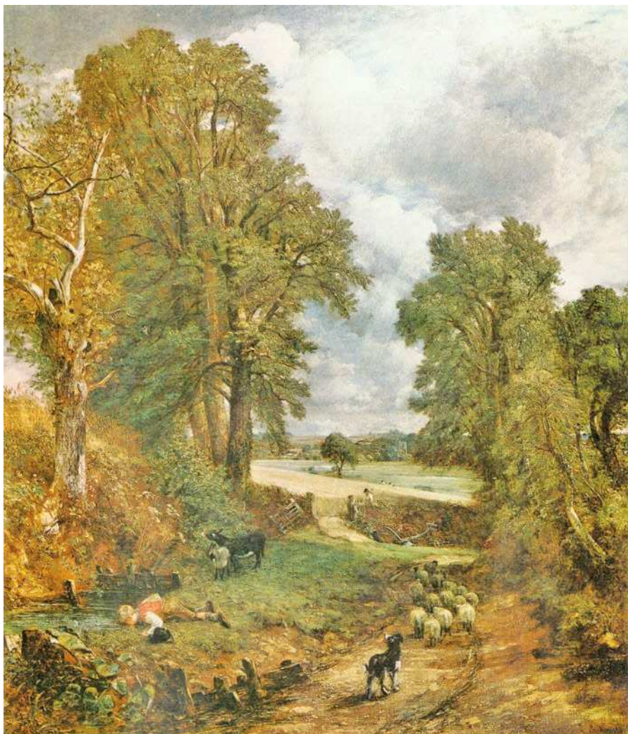
John Constable. The Cornfield. 1826