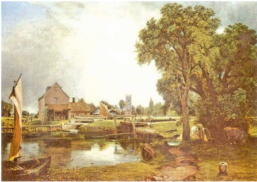
John Constable. Dedham Lock and Mill. 1820